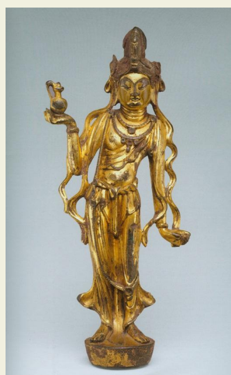
Avalokiteśvara Chinese, 8 th century gilt-bronze