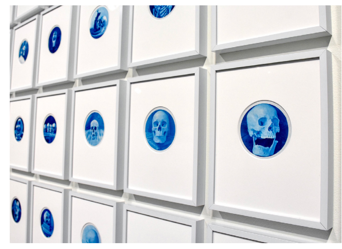
William Wylie, Quaranta (The Groom's Still Waiting at the Altar) , 2021, cyanotype on Japanese paper.

Twitter: <u>@Art_UVA</u> Facebook: <u>@UVA.Art</u>