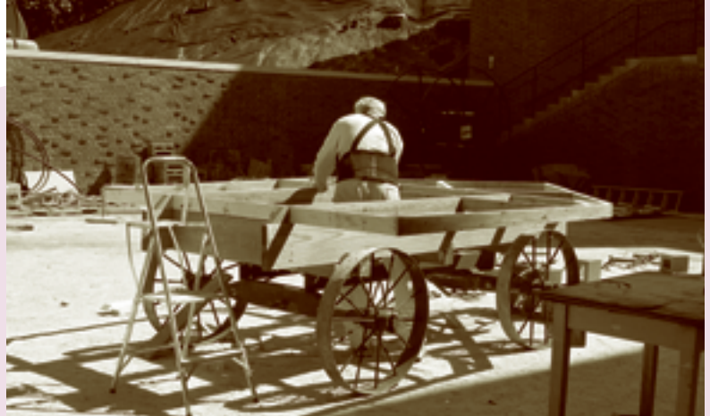
BILL BENNETT WORKS IN THE EXTERIOR SCULPTURE SPACE