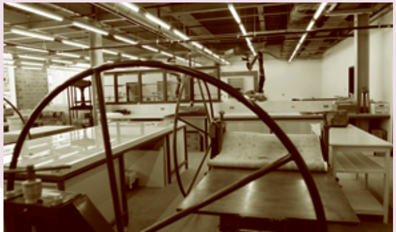
THE NEW WOODSHOP