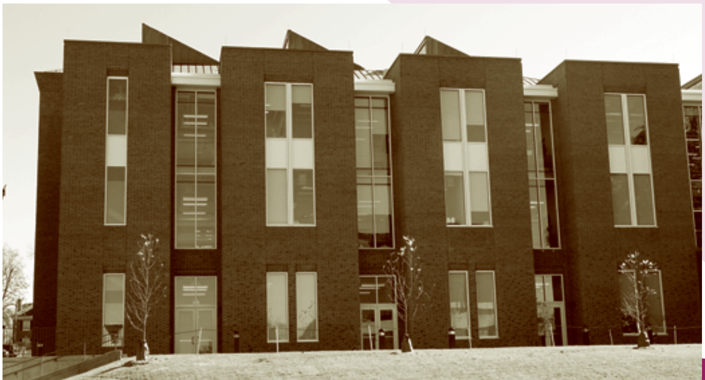
THE EXTERIOR OF RUFFIN HALL