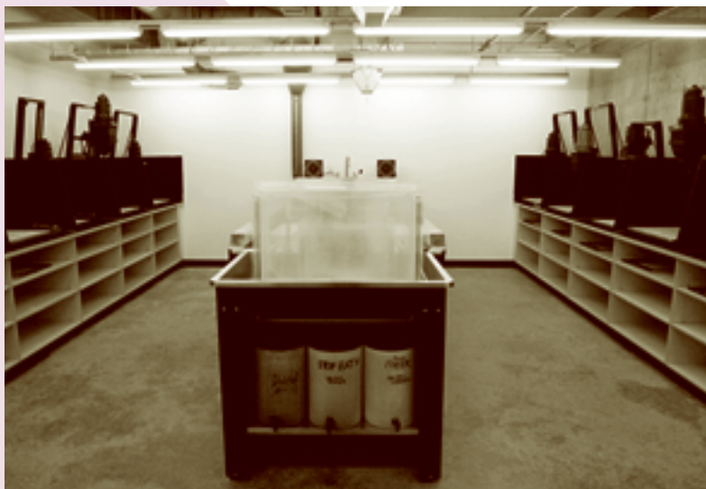
STATE-OF-THE-ART DARK ROOM

At this writing, while we are still sorting out the location of furnishings and supplies and work continues on the punch list, it's becoming ever clearer that we've occupied a remarkable facility. Ruffin Hall (42,000 sf) takes advantage of its site, the sharp slope that drops from the top of Carr's Hill to the level of the Drama Building, to provide exterior access to all three floors. It's also strikingly varied as seen from different angles, appearing to be the scale of the Museum and fraternity houses on Rugby Road when seen from Bayly Drive, but when seen from the north or west, to be the scale of Campbell Hall and Drama. Its varied massing and roofline even suggest the concept of a village of workshops that Studio faculty articulated in programming discussions with the architects.