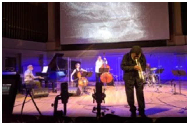
Wadada Leo Smith and The Golden Quintet, 2018