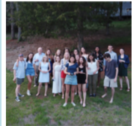
4th Years, 2018