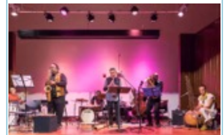
Untempered Ensemble, 2016