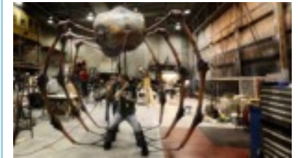
Festival of the Moving Creature, 2013